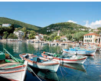
Kyparissa location above the harbour (top left)